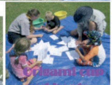
Orleam cup and boats