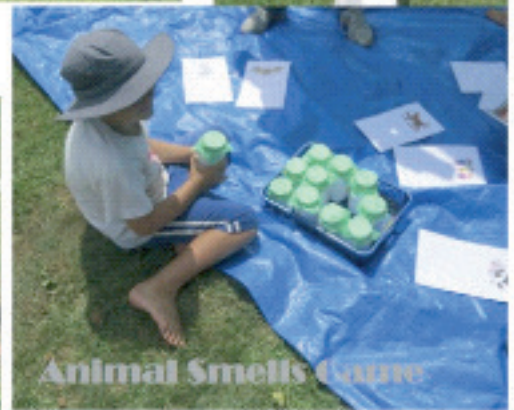
Animal Smells Game