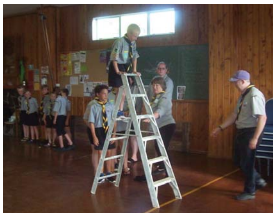
Cubs leaving the Cub section to move up to the Scout Section December 2018